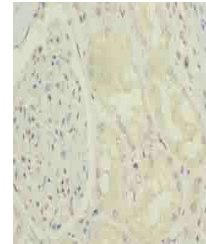
Immunohistochemical staining of human kidney tissue.