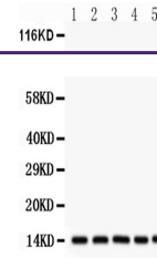
WB analysis of liver FABP using anti-liv...