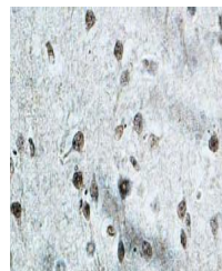
Immunohistochemical staining of fetal br...