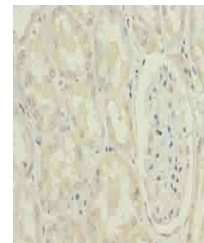
Immunohistochemistry of paraffin-embedde...