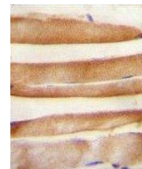
Immunohistochemical staining of human sk...