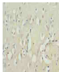
Immunohistochemistry of paraffin-embedde...