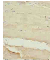
Immunohistochemical staining of human sk...