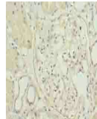
Immunohistochemical staining of human ki...