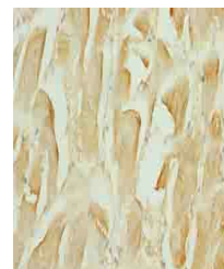
Immunohistochemistry of paraffin-embedde...