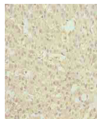
Immunohistochemical staining of human ad...