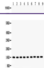
WB analysis of Cytochrome C using anti-C...