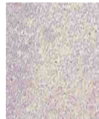
Immunohistochemical staining of human to...