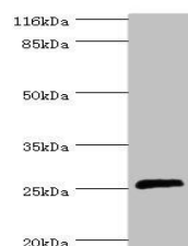
Western blot analysis of jurkat whole ce...