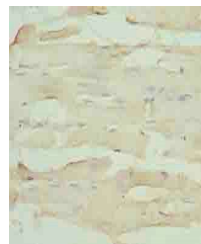
Immunohistochemical staining of human sk...