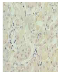
Immunohistochemical staining of human ga...