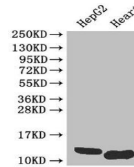
Western blot analysis of hepG2 cell