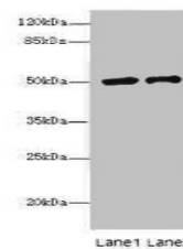
Western blot analysis of RAW264.7 whole ...