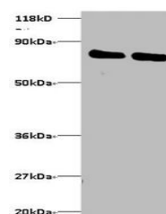
Western blot analysis of EC109 whole cel...