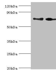
Western blot analysis of EC109(Lane 1), ...