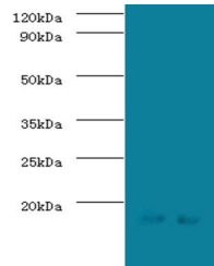
Western blot analysis of (Lane 1):jurkat...