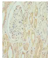
Immunohistochemical staining of human kidney tissue.