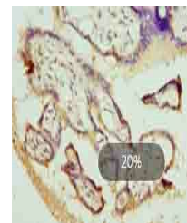
Immunohistochemical staining of human pl...