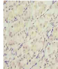
Immunohistochemical staining of human gallbladder tissue.