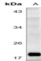
Western blot analysis of REG4 expression...