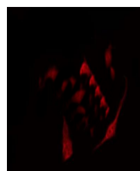
Immunofluorescence analysis of 293 cell ...