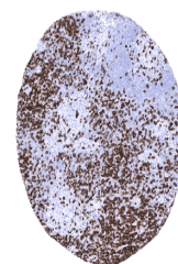
Tonsil Strong CD7 positivity of T lympho...