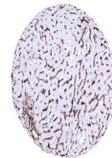
Liver: Sinusoids and Kupffer cells show ...