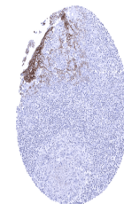
Tonsil In the tonsil a moderate to stron...