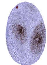
Lymph node In lymph nodes a strong CD23 ...