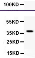
WB analysis of GRIK1 using anti-GRIK1 an...