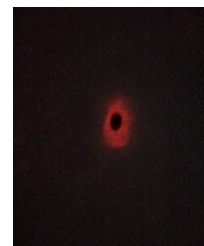
Immunofluorescent analysis of TWEAK stai...