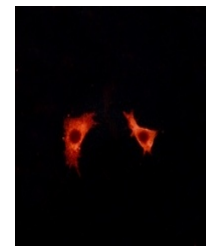
Immunofluorescent analysis of GPR41 staining...