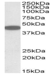
orb20503 (1ug/ml) staining of HEK293 lys...