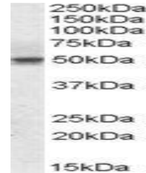
Western blot analysis of Human Testis ly...