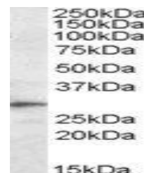
orb20251 (0.3ug/ml) staining of Mouse Li...