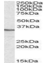
orb20241 (0.3ug/ml) staining of HEK293 I...