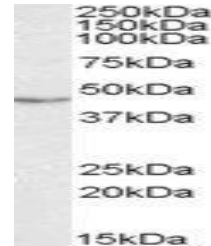
orb20085 (0.3ug/ml) staining of Jurkat I...