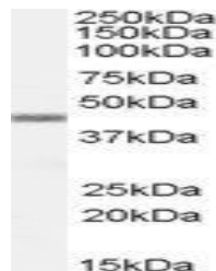
orb20027 (0.5ug/ml) staining of Daudi ly...