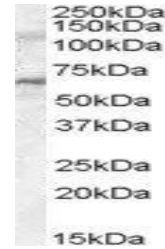
Western blot analysis of Rat Liver lysat...