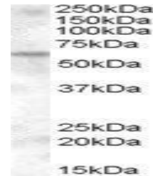
Western blot analysis of Human Muscle ly...