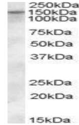
orb19634 (0.3ug/ml) staining of Human He...