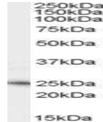
orb19603 (0.1ug/ml) staining of Human He...