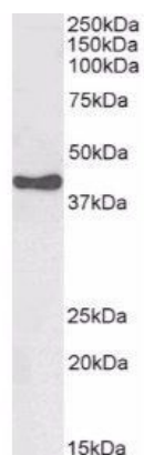
Western blot analysis of Human Adrenal Gland lysate using HSD3B1 antibody