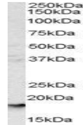
orb19105 (1ug/ml) staining of human live...