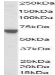
Western blot analysis of A431 lysate usi...