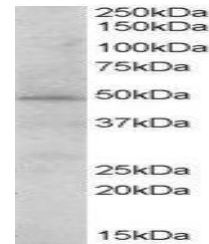
Western blot analysis of human heart lys...