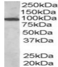
Western blot analysis of Human Bone Marr...