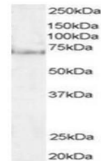
Western blot analysis of HeLa lysate usi...