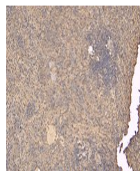
Immunohistochemical staining of Human Sp...