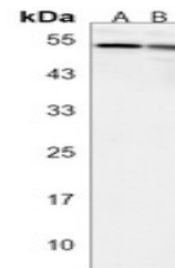
Western blot analysis of SCARA5 expressi...