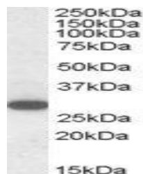
orb18808 (1ug/ml) staining of Human Peri...